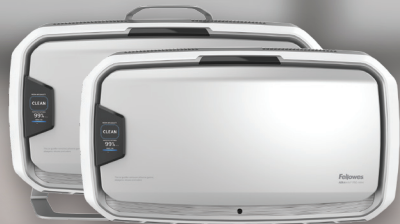
AeraMax AM 4 Series purifies 650-1,100 Square Feet