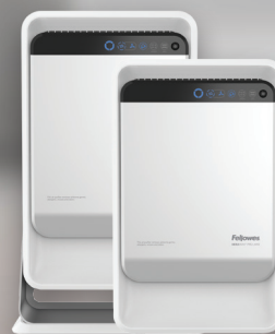
AeraMax AM 2 Series purifies 150-250 Square Feet

Air Purification Solutions (Planning and Budget) Provided by Indoff - Silicon Valley & North Denver Urban Branches