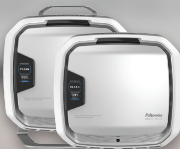
AeraMax AM 3 Series purifies 300-550 Square Feet