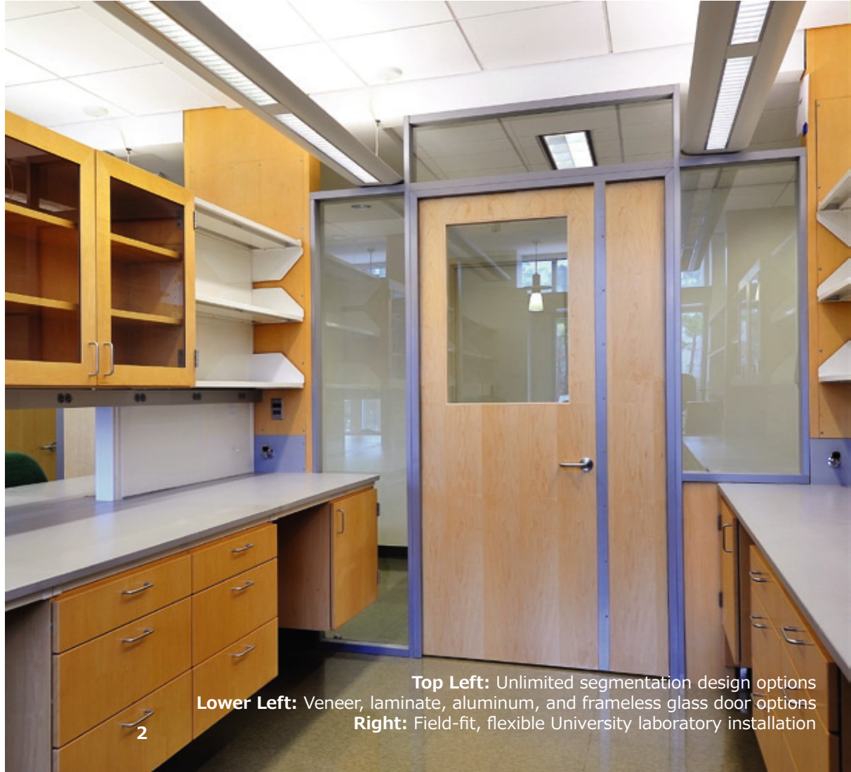
Top Left: Unlimited segmentation design options Lower Left: Veneer, laminate, aluminum, and frameless glass door options Right: Field-fit, flexible University laboratory installation