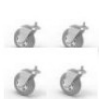
Locking Caster Set