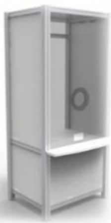
Front Transaction Option