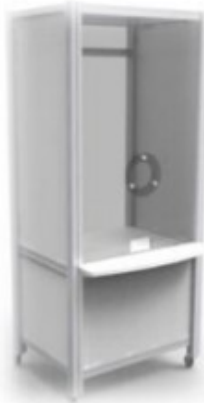
36" Wide, Mobile Option