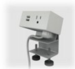
Side Mount Power