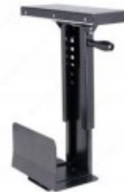
CPU Holder (Swivel)

Contact Peter Harnack Peter.harnack@indoff.com 408.656.1709 (text or call) 303.997.2086