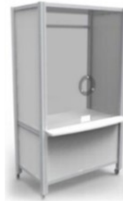
48" Wide, Mobile Option

Contact Peter Harnack Peter.harnack@indoff.com 408.656.1709 (text or call) 303.997.2086