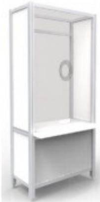
Booth 36" Wide