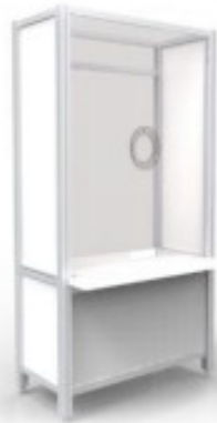
Booth 42" Wide