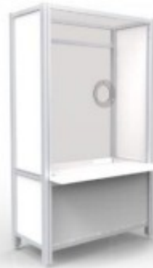
Booth 48" Wide