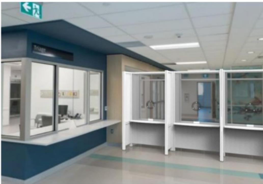
Side by Side Connected