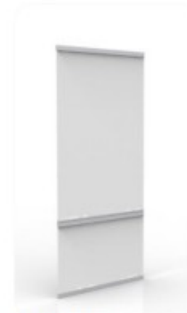
Spacer 24"/36"/48" Wide